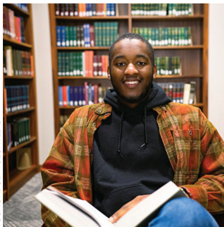
YOUNG ADULT VOLUNTEERS

The Young Adult Volunteer (YAV) program is a faith-based year of service in sites across the U.S. and around the world that has been changing the lives of young people ages 19–30 for nearly three decades. YAVs work with local agencies to address root causes of poverty and reconciliation while exploring the meaning of their Christian faith.